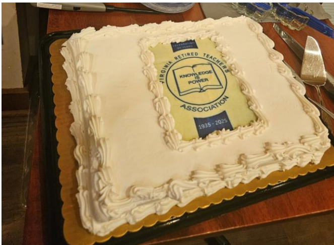
90th Anniversary cake

Many thanks to everyone who attended and donated door prizes. Our meeting was very informative and enjoyed by everyone!