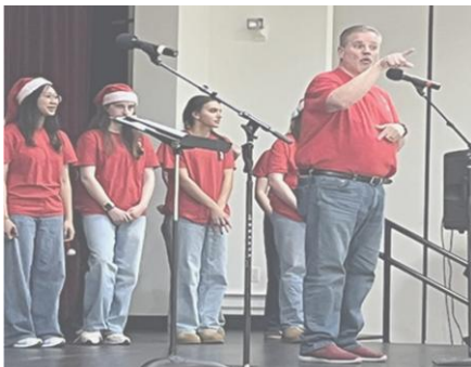
Annandale High School Chorus