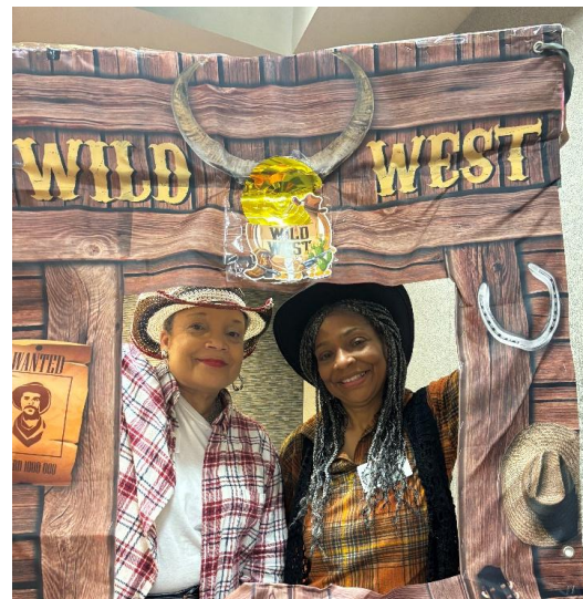
October's Wild West Themed Meeting