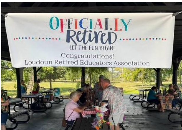
Annual School’s Out Forever Picnic

As we look ahead, we remain committed to making a difference in our community, learning, and celebrating together.