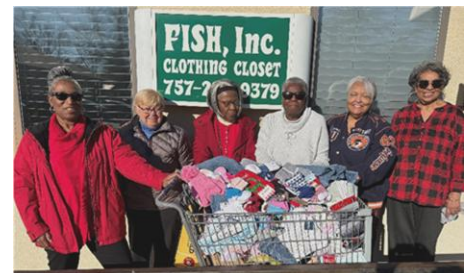
Basket full of donations