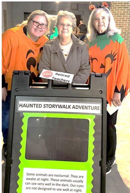
Haunted Story walk Adventure