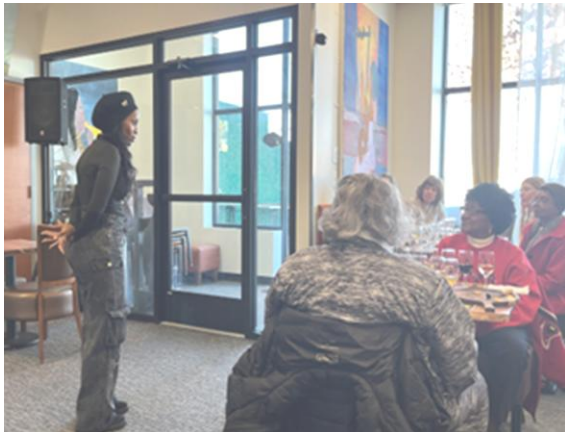
Trip to Negus Winery