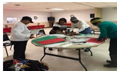
Wrapping Holiday Gifts

The luncheon at 12:00 noon on Tuesday will be the first function for those not on the Board of Directors.