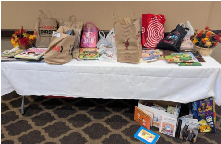
A small sample of the more than 900 books collected at the District N Fall Meeting!