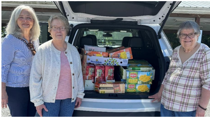
Food Drive for the Feed My Sheep Food Pantry