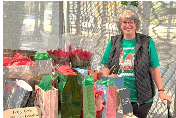
Door prizes for Holiday Meeting