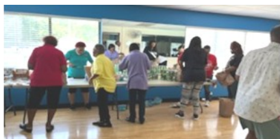
Helping the Food Pantry

This spontaneous act of collective action showcased the Heart of PREA and the organization's commitment to be of service to others during these times of need.