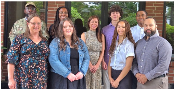
Scholarship winners and their guests