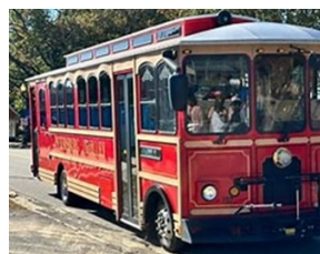
Trolley Tour of Petersburg