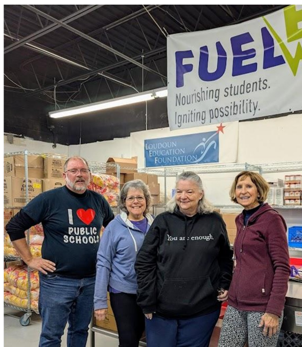
Helping out at the Food Pantry