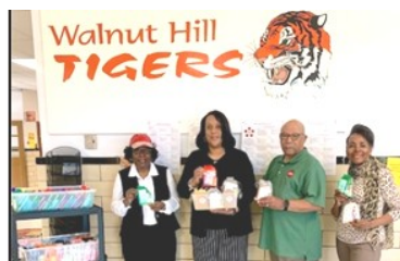
Gift bags for National Teacher Appreciation Week

The Petersburg/Prince George Retired Teachers and their spouses took the Black History Trolley Tour of the City of Petersburg. The tour included historical sites such as: the "safe house" where MLK, Jr. stayed while he was in Petersburg, the first all-black hospital building, and the former all black schools which were Peabody and Giles B. Cook and other historical sites. After the very enlightening and educational tour the retired teachers and spouses had lunch at one of the historical buildings that is now a well-known restaurant in Old Town Petersburg.