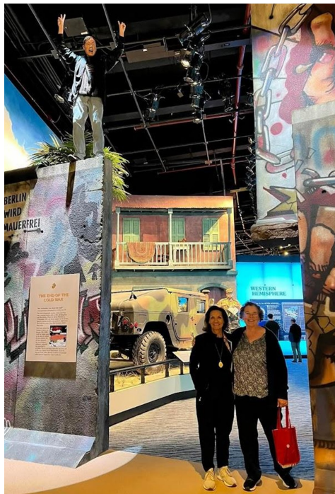
At the National Museum of the Marine Corps

Additionally, our unit participated in District N's spring collection of school supplies, which supports students in Appalachia. We are proud to be part of this important outreach and to continue our commitment to service in retirement.