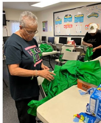
Packing CHIPP bags for students

The zoom sessions for 2024-2025 concluded on Monday, June 30, 2025, and will resume on Monday, September 8, 2025.