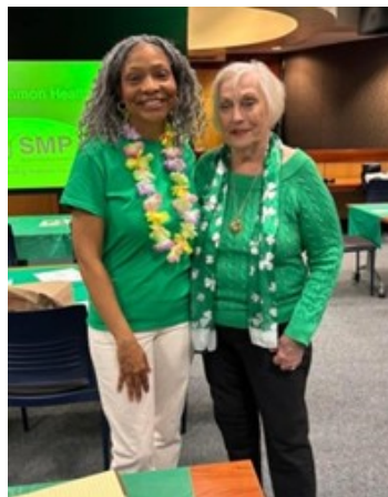
Celebrating St. Patrick's Day