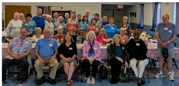
Photo District N Meeting May 14 Hosted by the Clarke County Retired School Employees Association

District N was well represented at the VRTA Delegate Assembly in Richmond on April 29-30.