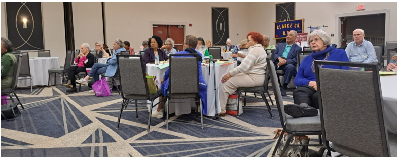
Scenes from the 2025 Delegate Assembly

U. S POSTAGE PAID Daleville, VA Permit No. 38 ZIP CODE 24083 PRSR STD