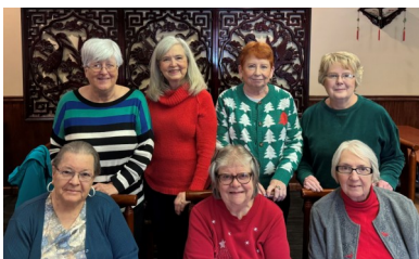
Buchanan RTA continues to be active in the community