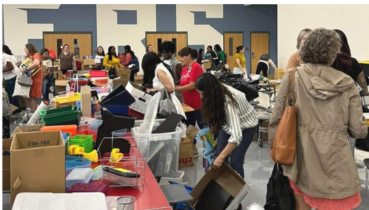
Volunteers are helping with new teacher supply give away.

As we look ahead, we remain committed to making a difference in our community, learning, and celebrating together.