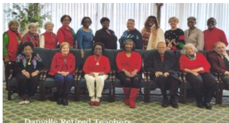
Danville's Retired Teachers Association