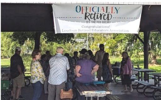
Kickoff picnic in September