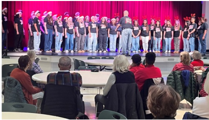
Annandale High School Choral Group