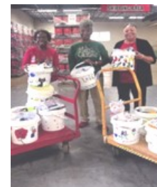
Helping God's Pit Crew