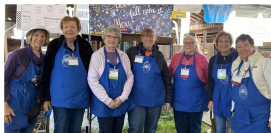
Volunteer Helpers with Inova Ladies Board Rummage Sale