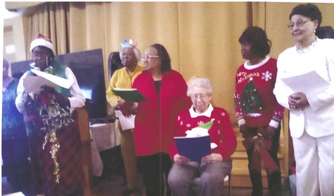
"The Colors of Christmas"

Brunswick Retired Teachers entertained the senior citizens at their Christmas luncheon with a skit entitled "The Colors of Christmas." They also donated supplies to the center. During the year they did many other activities which included Trunk-a-Treat with the kids. The unit also awarded a deserving senior a $500 scholarship.