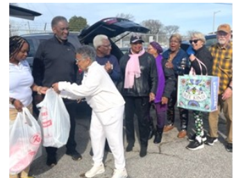
Food donations for Thanksgiving meals