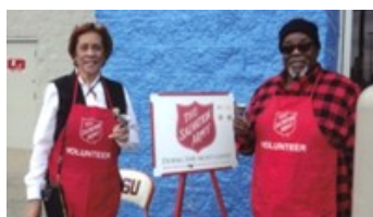
Helping the Salvation Army

We now look forward to awarding our two $500.00 scholarships to qualifying recipients.