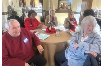
Holiday Luncheon in December