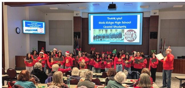
Rock Ridge High School Chorus performs at our December meeting.