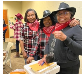
Country Western November meeting

PREA recently hosted their annual Pack the Bus for the HER Shelter, donating needed household items for victims of Domestic Violence.