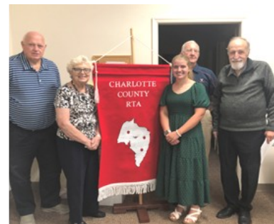
Newly installed officers