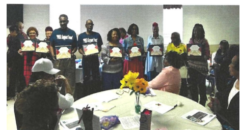
Members Receiving Certificates