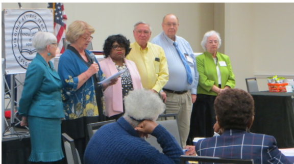
Officers being installed at the Spring 2024 Delegate Assembly