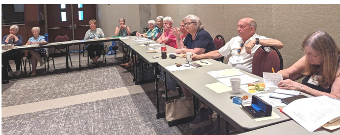
LREA Members discussing books and shows at our June 2024 Business Meeting.