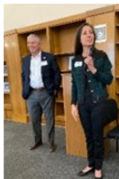
Guest Speakers at Meetings