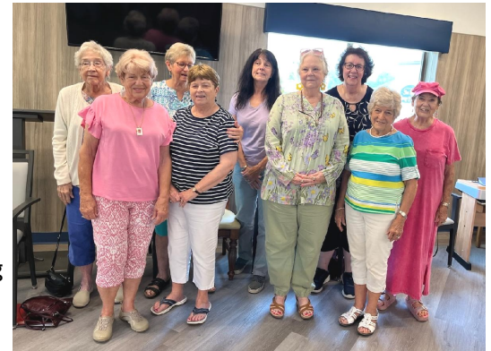
Patrick County RTA Lead Singing at Nursing Home & Landmark Center

Stay tuned for more to come from Patrick County Retired Teachers Association!