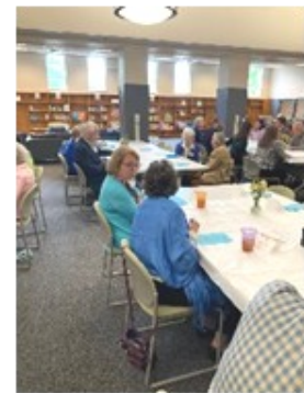
Lunch catered by Deep Run Roadhouse