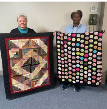
Samples of quilting projects— Log Cabin Pattern, on the right and Circular Pattern on black background, on the left