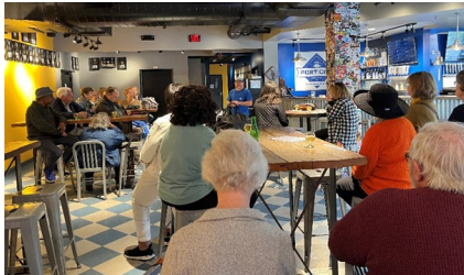
OKTOBERFEST at Port City Brewery

Our October meeting was our very own OKTOBER-FEST, which was held on October 16 at the Port City Brewery in Alexandria. Following a brief history of the brewery and tour of the facility, members were given tastings of the gold medal winning brew, Optimal Wit. Members were then given five tickets for five additional tastings and if they wanted to save any tickets, they could redeem them for tastings at a later time! Members also had an opportunity to taste Bavarian bratwurst, German pretzels and a variety of German cookies. Everyone seemed to enjoy our time together!