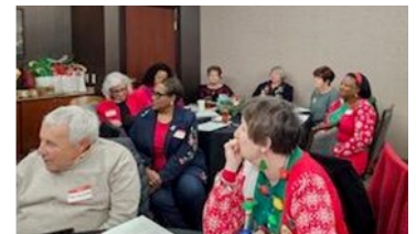
Roanoke's City Holiday Luncheon