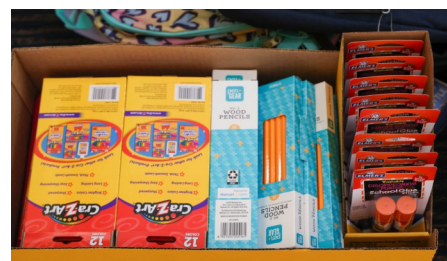
Collected School Supplies