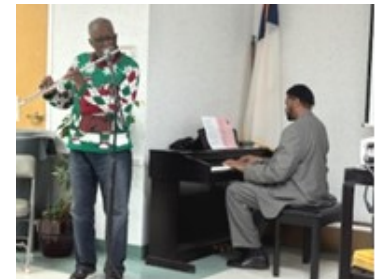
Entertainment by "Melodies of the Season"