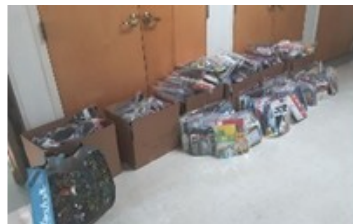
Collected School Supplies