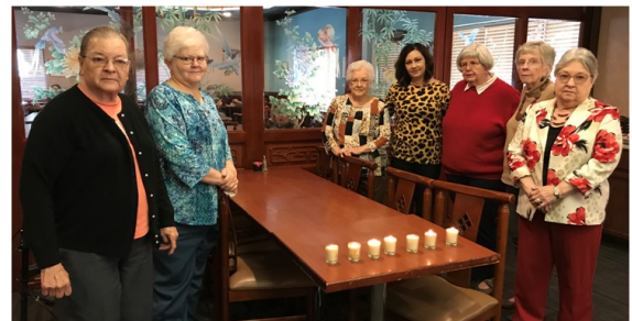
Members attend Memorial Service

During the past year BCRTA members have sponsored a food drive and participated in Buchanan County Public Library's Haunted Story Walk. As a group, we have made donations to Friends of Buchanan County's Public Library, Shop with a Cop, Coal Miners' Christmas fund, and the Boys and Girls Club of Central Appalachia. Both as a group and individually, we inspire to serve our community.