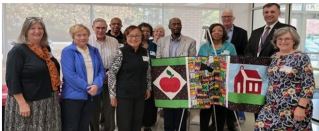
Hanover Retired School Employees