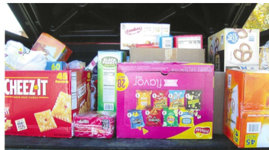
District N held its Fall Meeting, hosted by Frederick County Retired Teachers. They collected a truck load of single serve snacks for the Bright Futures Organization of Winchester and Frederick County, along with a cash donation of $876.