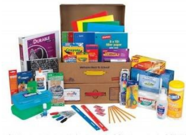
Supplies for Laburnum Elementary School