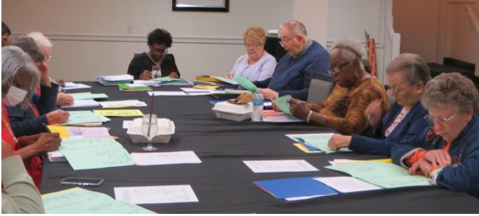
Executive Committee Meeting