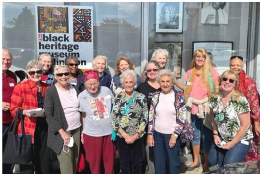
Arlington RTA members gather before visiting the Black Heritage Museum of Arlington on October 12.