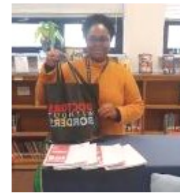
Lakeside Elementary School Librarian