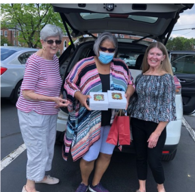
Wine tasting supplies