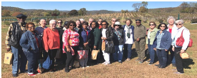
Winery Visit on October 24h

In November, we had our combined meeting with Arlington Retired Teachers. In December, we had our annual holiday concert with the Mount Vernon Men's Chorus and a visit from Santa Claus.