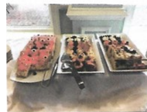
Spooky fall luncheon