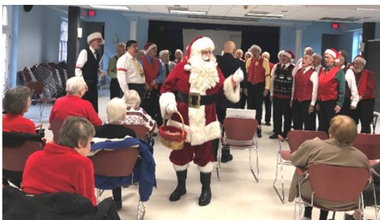
Mount Vernon Men's Chorus Entertain and Santa Visits