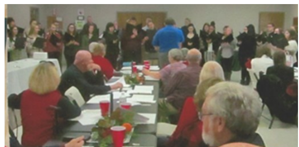
Luray High School Choir entertains Page County Retired School Personnel