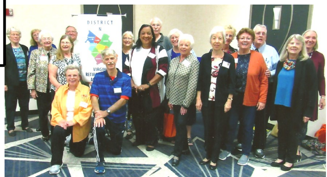
District N members attend VRTA Fall Conference