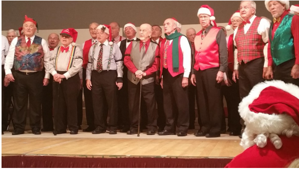
Heritage Harmony Chorus