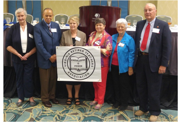
VRTA Past Presidents