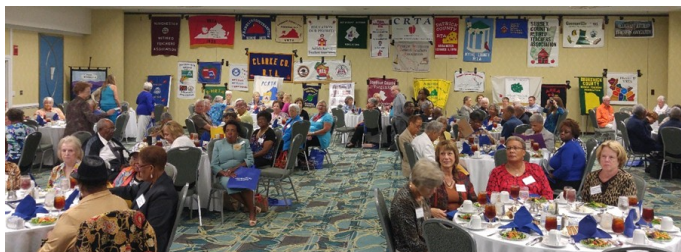
VRTA 2016 Fall Conference