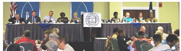
Head Table — Fall Conference