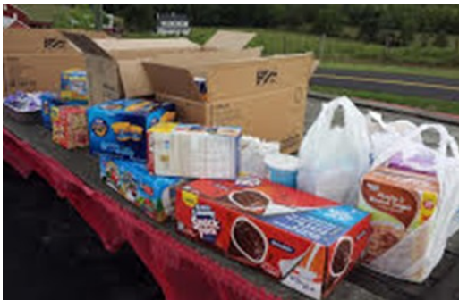
Back to School Food Drive