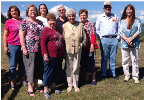
Scott County Retired Teachers visit the Wilderness Trail Blockhouse.