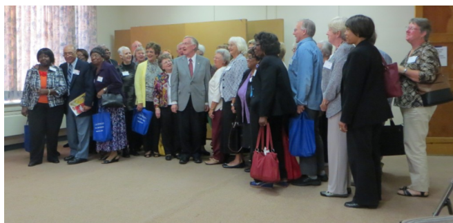
VRTA Members at Fall 2014 Legislative Workshop