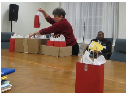
Executive Committee Meeting