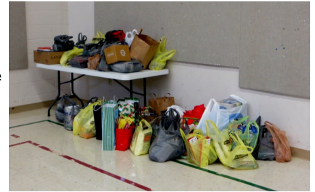
BRE's December Service Project — Toiletry items for assisted living home

At both meetings in the spring, BRE members donate money for the scholarship fund and the book fund. BRE gives two $1,000 scholarships to a senior from each of the county high schools. The recipients plan to enter the field of education. Money collected in the book fund is used to purchase books for the libraries in each of the schools in the county. Last year two books were purchased for each of the 11 schools in Botetourt County.