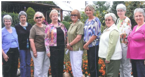
Retired educators from Roanoke County and Roanoke City on their trip to the Shenandoah Valley

On December 10, 2014, RCREA members and their guests, met at Hidden Valley Country Club for our annual Christmas luncheon. A program by "Hands for God Puppet Ministry" was presented.