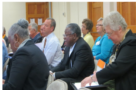
Board of Directors Meeting