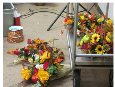
Flower Arranging Workshop