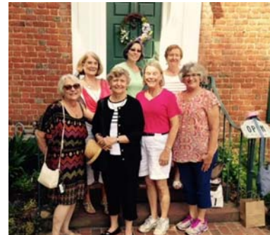
ARTA members at Green Spring Garden Park