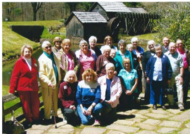
Day-trip along Blue Ridge Parkway south to Bent Mountain Bistro, Nancy's Candy, Mabry Mill, and Chateau Morrisette April 28. Twenty-six retired teachers and spouses from Roanoke City, Roanoke County, Salem City and Montgomery County enjoyed a beautiful day on the Blue Ridge Parkway. Another trip is being planned for October 13th to Apple Ridge Farm.