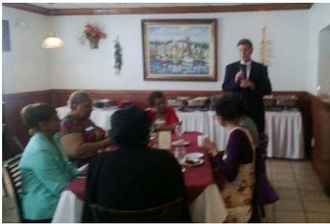
Congressman Don Beyer answers questions at ARTA Meeting.