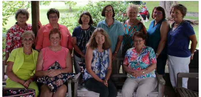
Floyd County Retired Teachers enjoy an outing.