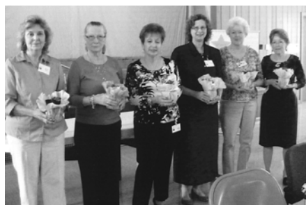
RCREA Executive Board recognized for their service for the 2013-14 year