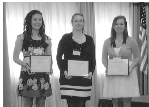
2014 Scholarship Recipients from Frederick County RTA

The Frederick County Retired Teachers' Association honored their 2014 scholarship winners during their May 2014 meeting at the Travelodge in Winchester, Virginia. Each recipient received a one thousand dollar scholarship to use toward her education degree at a college of her choosing. The recipients represented the three high schools in Frederick County. The scholarship program is one of several programs that the local association sponsors through its community outreach programs. Other outreach programs include the Annual AARP Food Drive, supporting students at the local Winchester Day Care Program through donations of educational supplies, and individual community service programs. The local unit looks forward to another successful year supporting our schools and community during the 2014-2015 year.