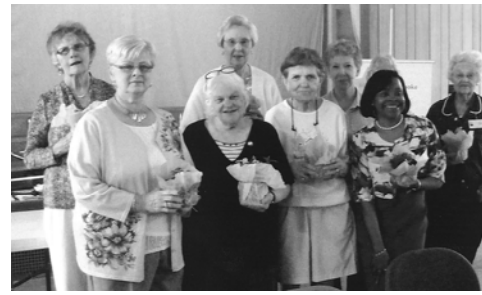
RCREA Committee Members recognized for their service for the 2013-14 year