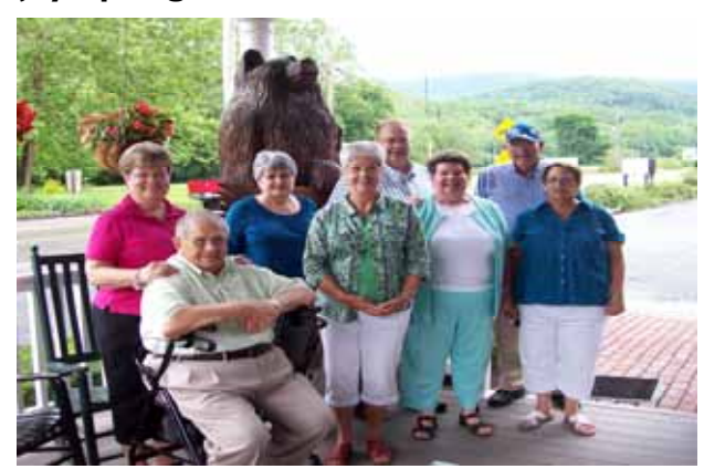
BRE members at Swinging Bridge Restaurant

The Botetourt Retired Educators held its final meeting of the 2011-2012 year at the Blue Ridge Vineyard in Eagle Rock, Virginia. The winery is owned by a retired Botetourt County educator and her husband. A catered picnic lunch was enjoyed by all in attendance, and officers for the next two years were installed at the meeting. In June a group of BRE members went to Paint Bank, Virginia, to have lunch at the Swinging Bridge Restaurant. This restaurant is known for its buffalo burgers and the swinging bridge that crosses the length of the restaurant.