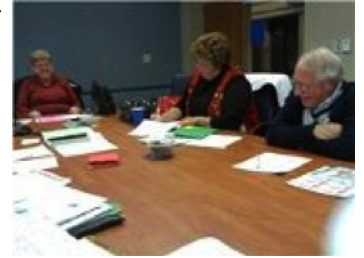
HRSPA Legislative Committee Workshop

kept the members informed of pending legislation and provided contact information for them to contact legislators about issues of interest to them during the most recent Legislative Session. More members have joined this important committee. The HRSPA Legislative Committee has plans to expand its work during the next session.