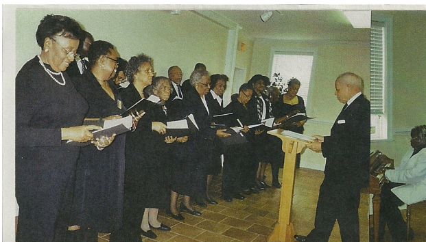
Bruton Heights Alumni Choir serenade association members at recent meeting. (This photo was included in their May 2011 newsletter.)

One goal of the Williamsburg-James City County Retired Teachers Association was to re-establish a newsletter. In its May 2011 edition several events were highlighted. The group visited the historic First Baptist Church where they viewed historic displays and were serenaded by the Bruton Heights Alumni Choir. At end of the year a cookout was held on Saturday, June 18 th . The menu was fried fish and shrimp with all of the fixings. The unit submitted its first scrapbook at the state meeting where it received recognition. A $500.00 scholarship was awarded at the June meeting.