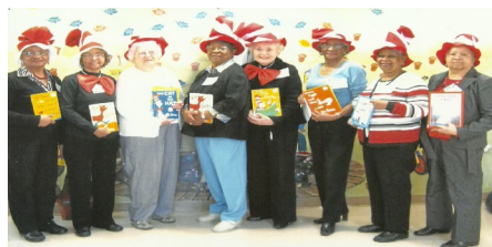
SRTA Readers at Suffolk Head Start