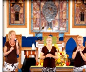
The Bowman Sisters